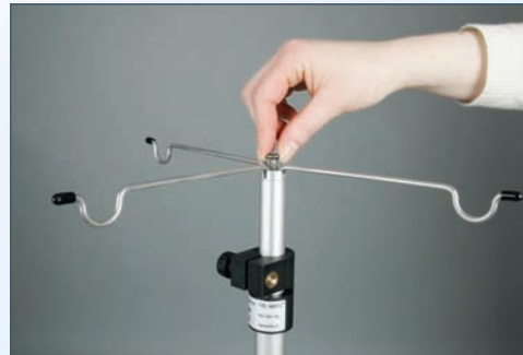
Assembling is user-friendly...