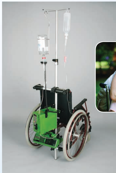
Some equipment that can be attached

VARIOFIX® raises your life quality besides optimizing flexibility for home care.